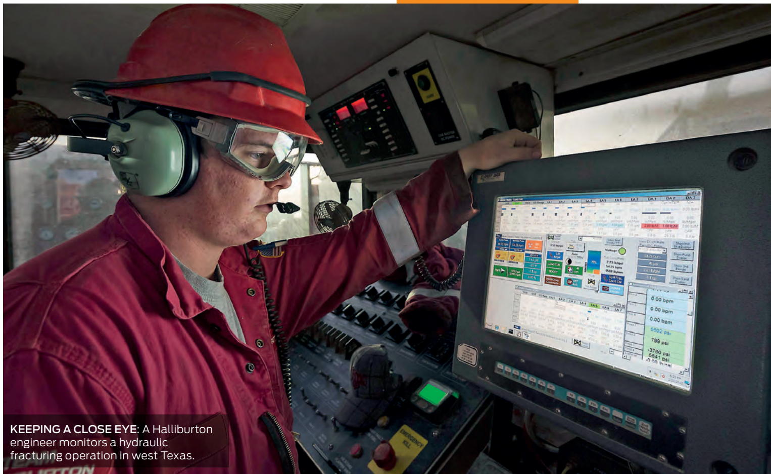
KEEPING A CLOSE EYE: A Halliburton engineer monitors a hydraulic fracturing operation in west Texas.

» of the rock. Knowing these properties helps identify which areas of the reservoir will respond most favourably to fracking. All of these factors together help engineers home in on the sweet spots.