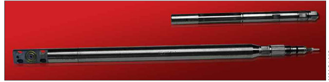
ROC™ gauge and cablehead connection