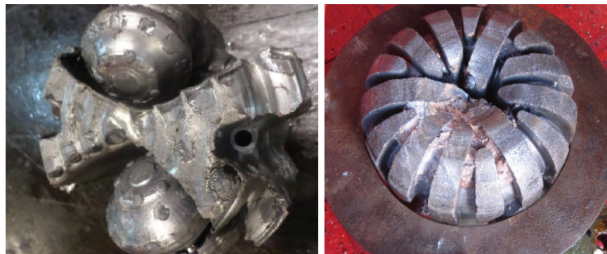
The hybrid bit design (left) with conventional rotary drilling was severely worn down at the end of its run, resulting in more bit trips and slower ROP. The TurboForce™ diamond-impregnated bit design (right), used with the Turbopower™ turbodrill, was in excellent condition at the end of its run, thus improving drilling length intervals and ROP.

It takes experience and know-how to design a solution that matches drilling technology with the appropriate bit for efficient drilling, especially in challenging formations. Halliburton Sperry Drilling was chosen for its ability to drill the vertical well to greater depths, and at a faster ROP than had been done before. Sperry Drilling engineers collaborated with the operator to thoroughly understand the challenges and complications it had experienced with similar wells. This led to a customized solution that could power through the pre-salt carbonate formation, combining the Turbopower turbodrill with a TurboForce™ diamond-impregnated bit.