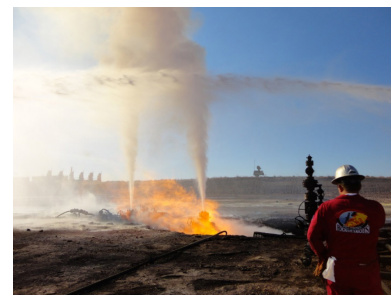
Figure 2. The fires of three proximate wells feed each other to create a complex fire hazard on the site. The side valve of the well on the right is compromised and is feeding a mixture of gas and condensate to the other two wells.