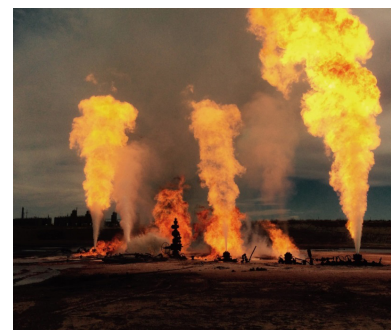
Figure 1. The six-well pad fire, with wells in close proximity and generating extreme heat, was the first blowout of its kind in the industry.

The challenge facing Boots & Coots and the operator was the first of its kind in well control history. Pad drilling is a relatively new practice in the petroleum industry. Although there has been some discussion among professionals about the risks associated with well control in pad drilling, the industry had not experienced multiple blowouts of wells in such close proximity.