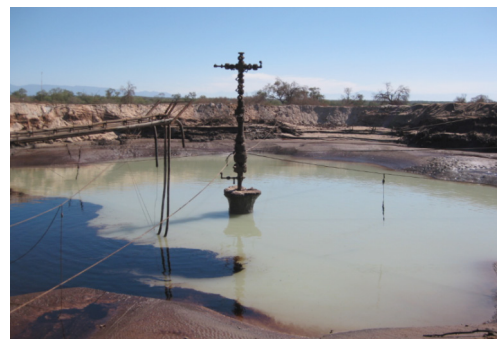
Figure 2. The wellhead is pulled upright after the well is brought under control and dynamically killed via the relief well.