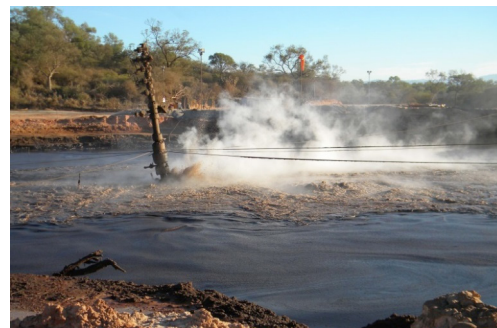
Figure 1. With the well emitting water and carbon dioxide, a crater is formed around it, thus creating a small lake.

In Houston, the Boots & Coots engineering team performed a detailed dynamic kill analysis. The plan called for all necessary equipment – frac pumps, kill lines, mud storage, 6,000 barrels of 12-ppg mud and additives – to be staged and ready for the dynamic kill as soon as hydraulic communication with the target well was established. All rig personnel were briefed and prepared for the operation, using a thorough risk analysis.