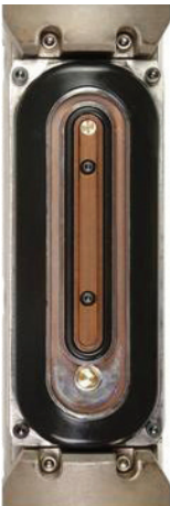
Oval Focused Pad