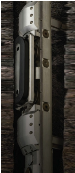
RDT tester oval pad